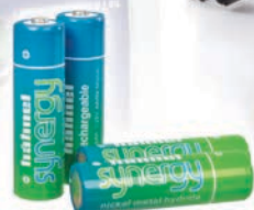
4 x AA 2500 Rechargeable Synergy

12V Car Lead for charging when on the move